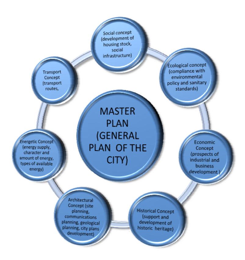
Pic. 1 Structure of Master Plan

City development in Belarus is done on the basis of MASTER PLAN which is elaborated by the Responsible bodies of Ministry of Construction and Architecture. It bears bounding legislative status and serves as the basis for city development. Can be compared to the IUDC.